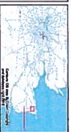
Key Plan Scale: A75